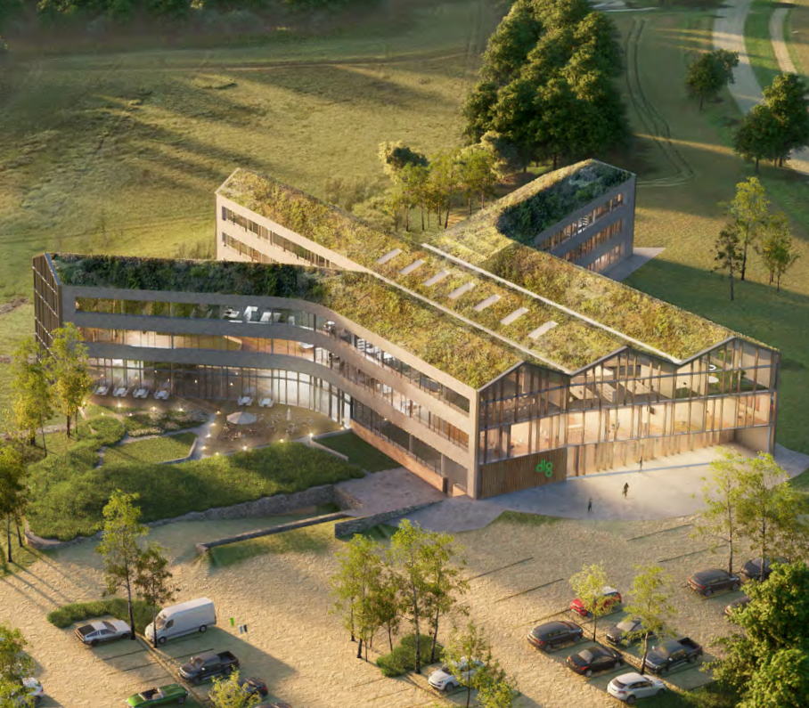
PROJECT DLG HEADQUARTERS, FREDERICIA // PLH ARCHITECTS