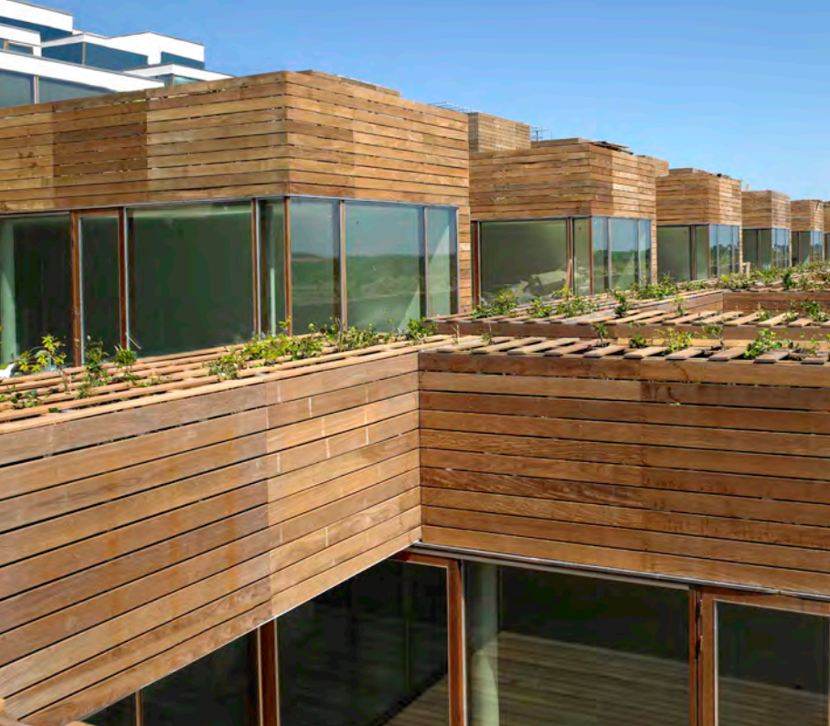
Full height mahogany windows and doors and aluminium glazing beads