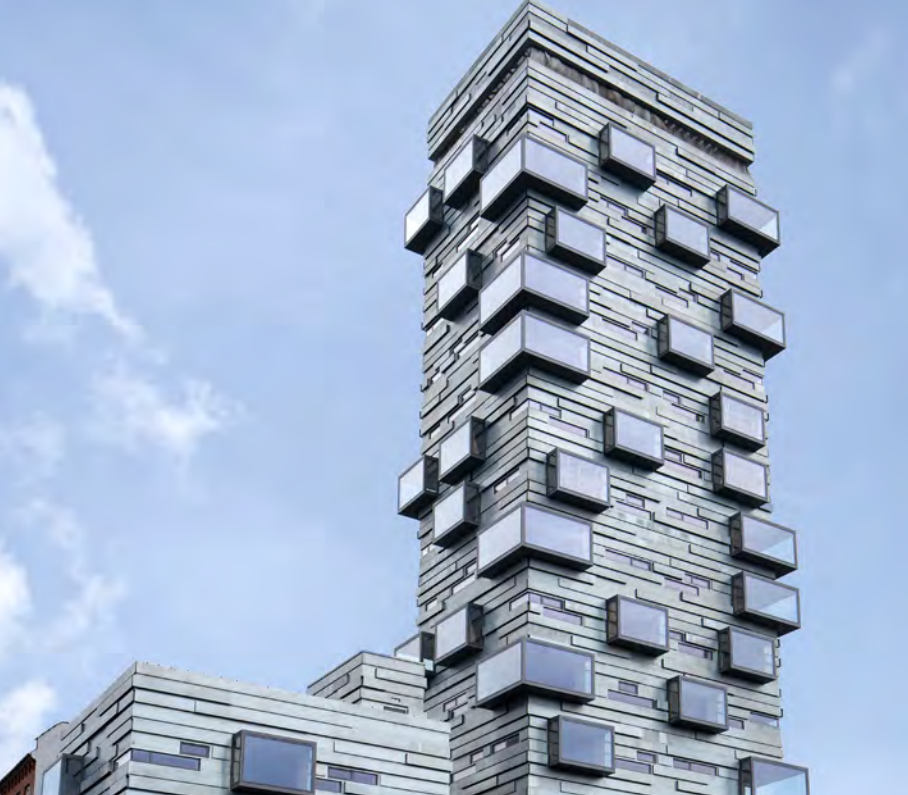
CHARLOTTETÅRNET, COPENHAGEN // LUNDGAARD & TRANBERG ARCHITECTS