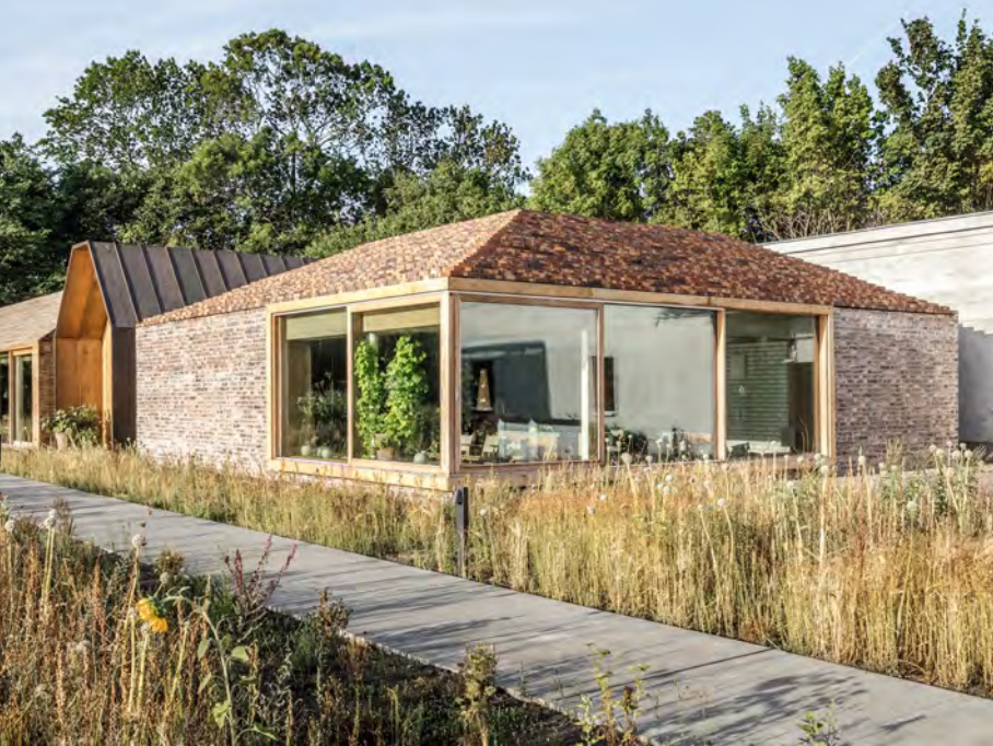
NOMA, COPENHAGEN // BJARKE INGELS GROUP