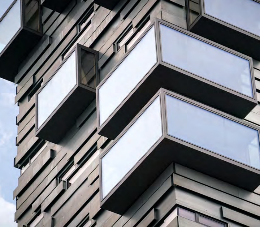
Oak/aluminium windows, glass bays and small corner posts