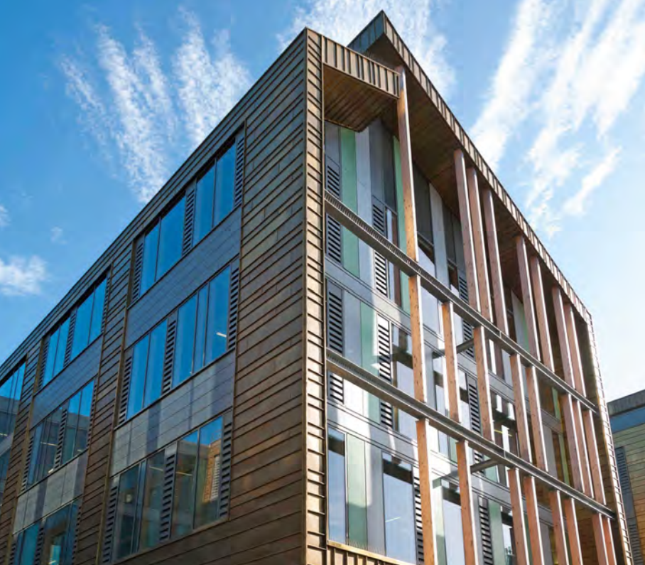
KEYNSHAM TOWN HALL, BRISTOL // AEDAS ARCHITECTURE