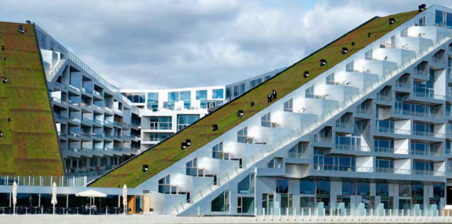
8 TALLET, COPENHAGEN // BJARKE INGELS GROUP