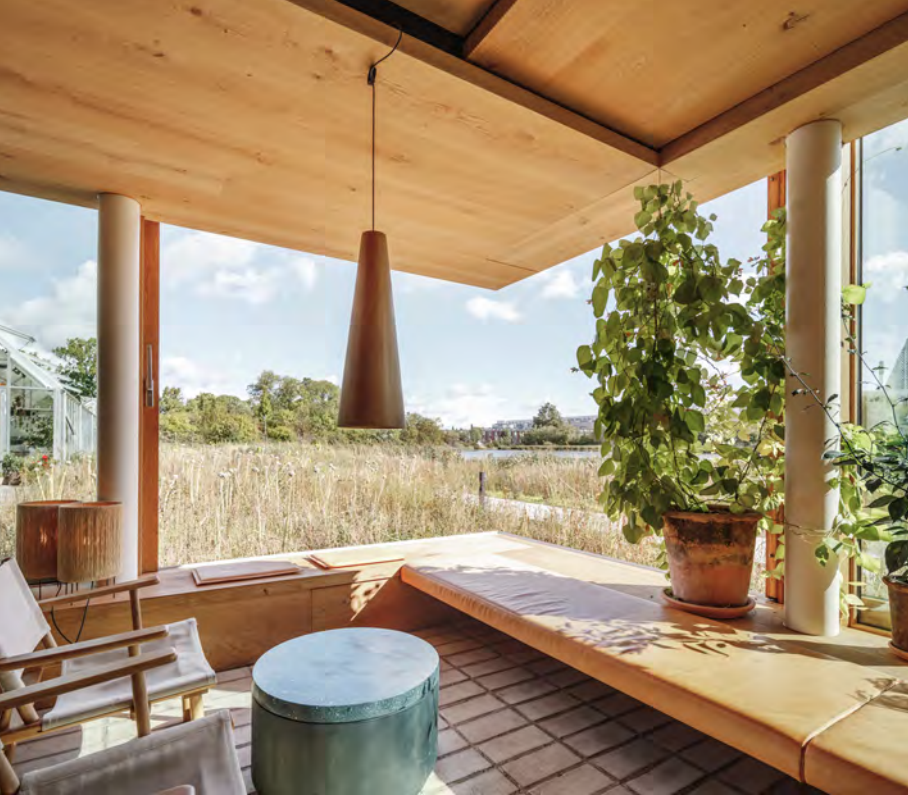
Oak windows, oak sliding doors and deep frames with seating