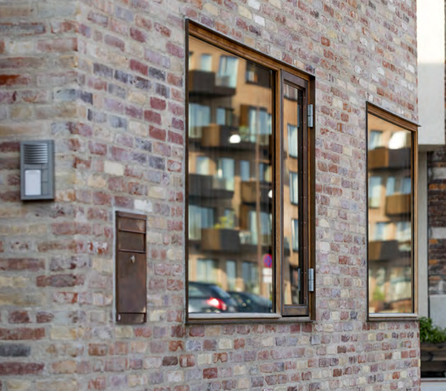
Teak windows and doors, openable sashes in copper and glass to glass corners