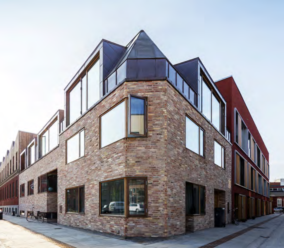
PRIVATE HOME, COPENHAGEN //