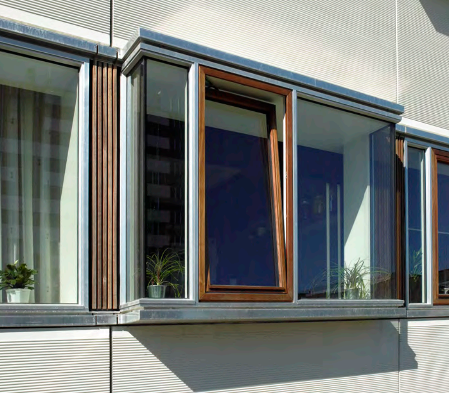
Mahogany/aluminium tilt/turn windows and glass to glass corners