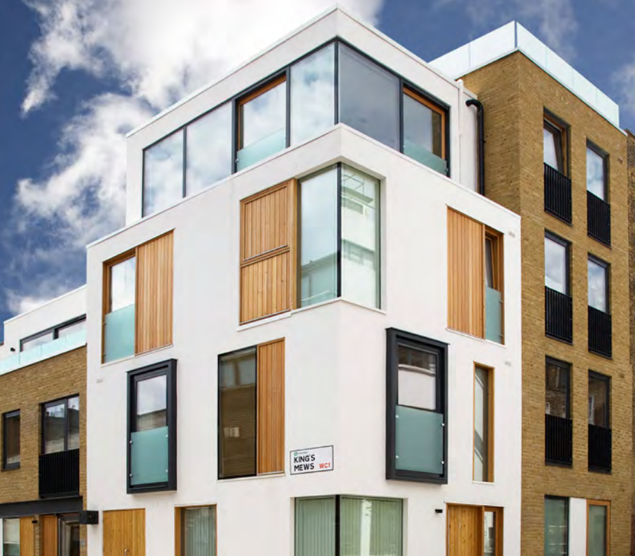
KINGS MEWS, LONDON // A+D STUDIO ARCHITECTS