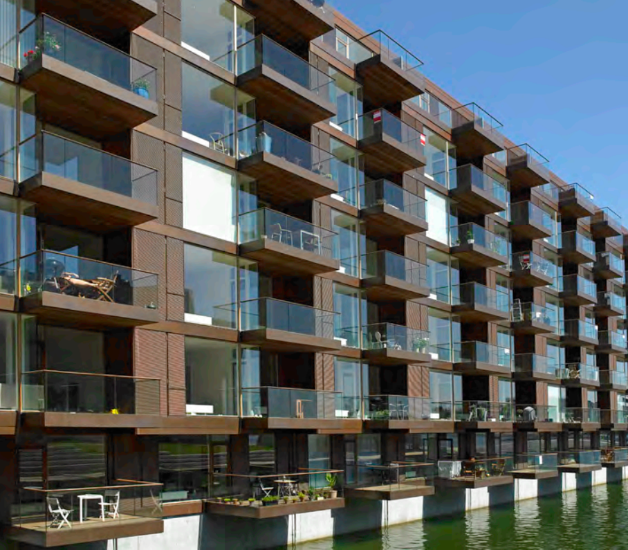
FREDERIKSKAJ, COPENHAGEN // DISSING+WEITLING ARCHITECTS