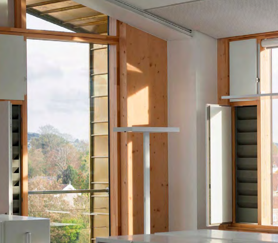
Wood/aluminium windows and doors, acoustic panels, deep frames and motorized window ventilation