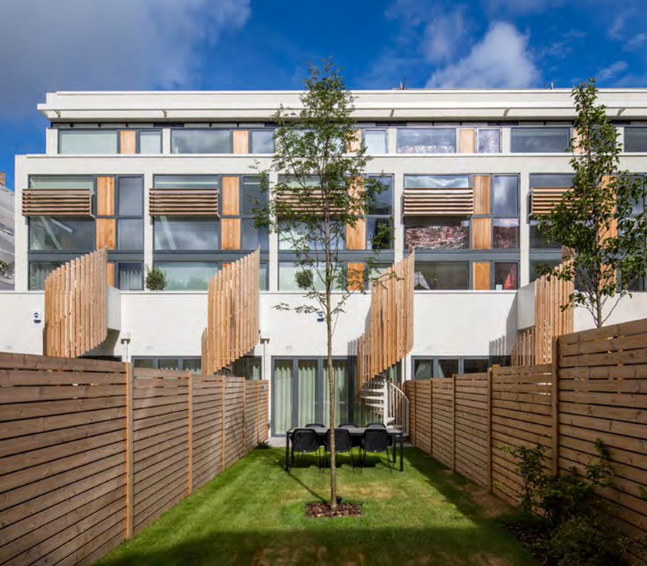
Wood/aluminium windows and doors, panels in cedar wood and frames with glued-on glass