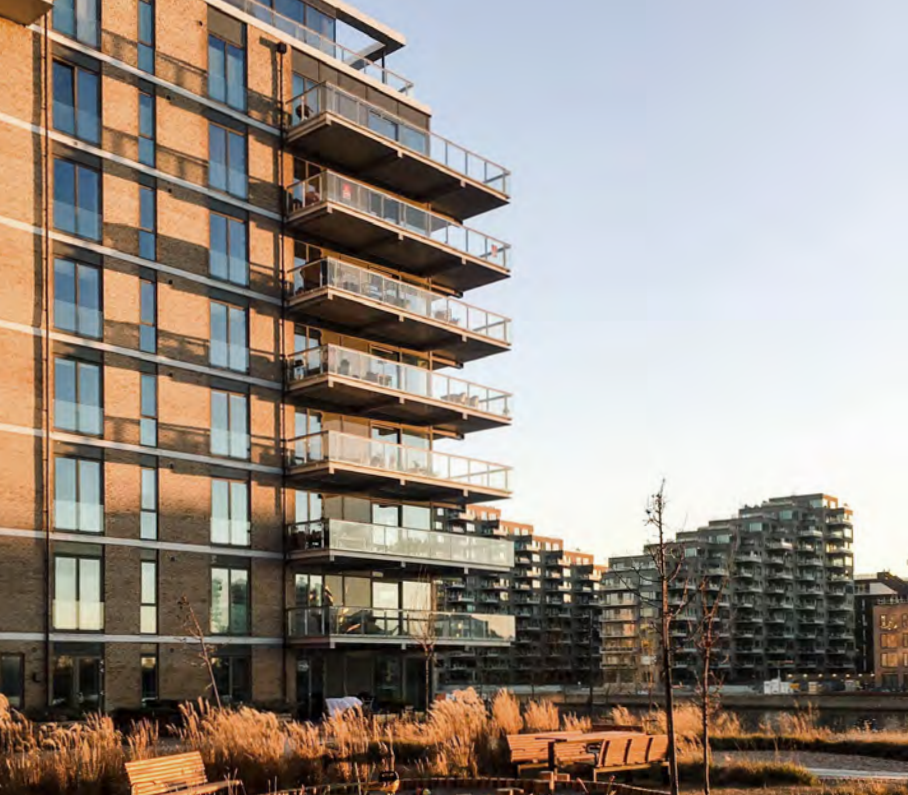
Wood/aluminium windows and doors and glass to glass corners