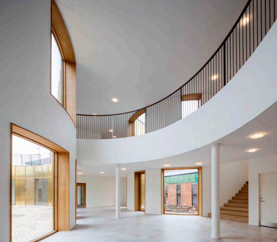
Curved oak/kebon windows with glazing beads in tombac