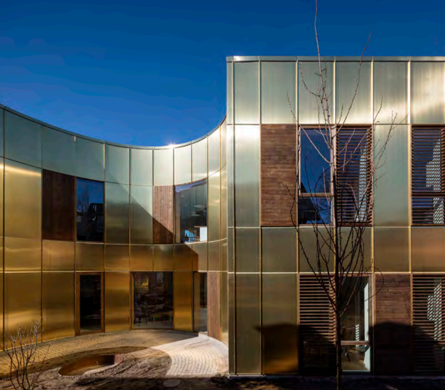
FREDERIKSBERG HOSPICE, COPENHAGEN // NORD ARCHITECTS