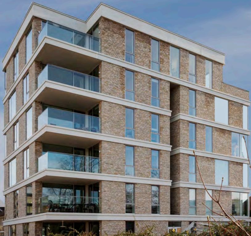
CHIMNEY HOUSE, COPENHAGEN // AARSTIDERNE ARCHITECTS