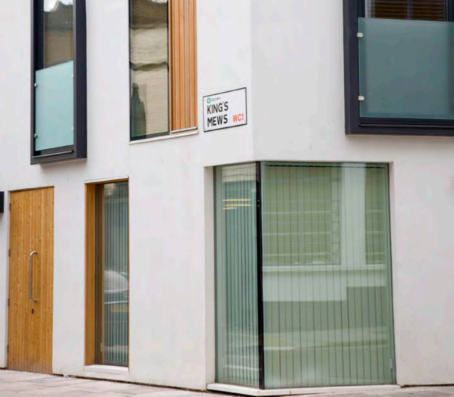
Wood/aluminium windows and doors. Panels in larch wood and frames with glued-on glass