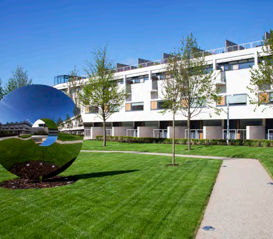
GABRIEL SQUARE ST ALBANS, LONDON AREA // BENSON & FORSYTH ARCHITECTS