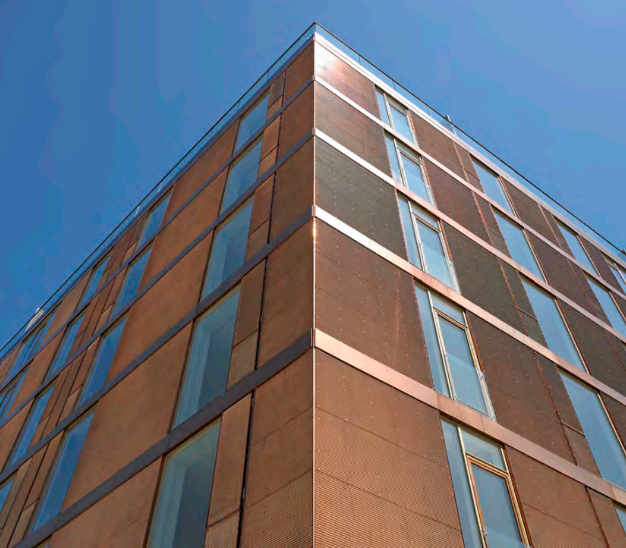
Teak/pinewood windows and doors and solid panels in copper