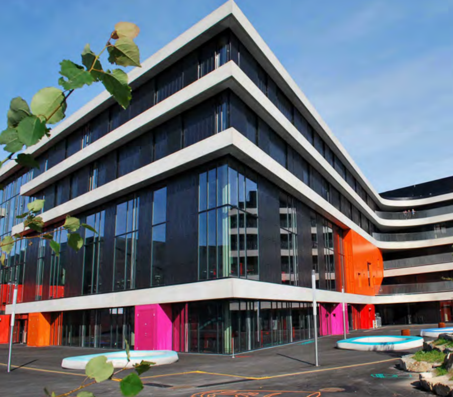
THOR HEYERDAHL SCHOOL, LARVIK // SCHMIDT/HAMMER/LASSEN ARCHITECTS