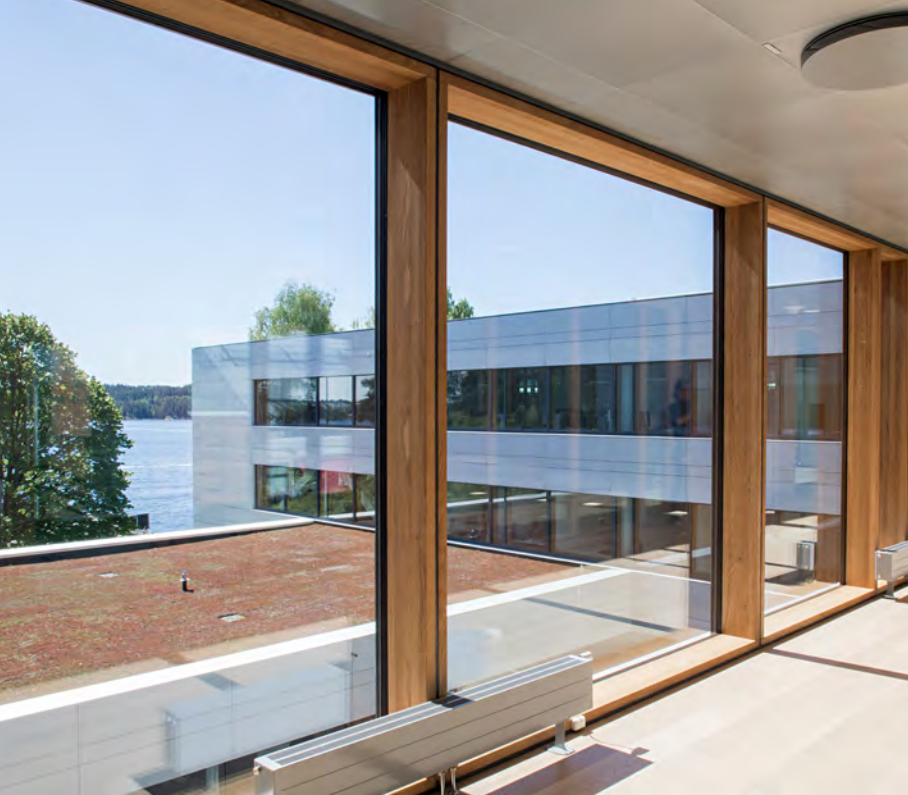
Oak/aluminium windows and doors, deep oak frames and glass to glass corners