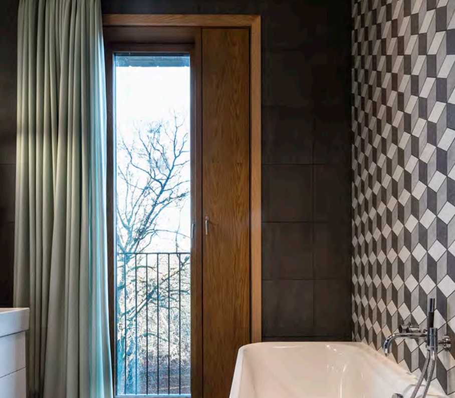
Oak/aluminium windows, doors, sliding doors and special window ventilation