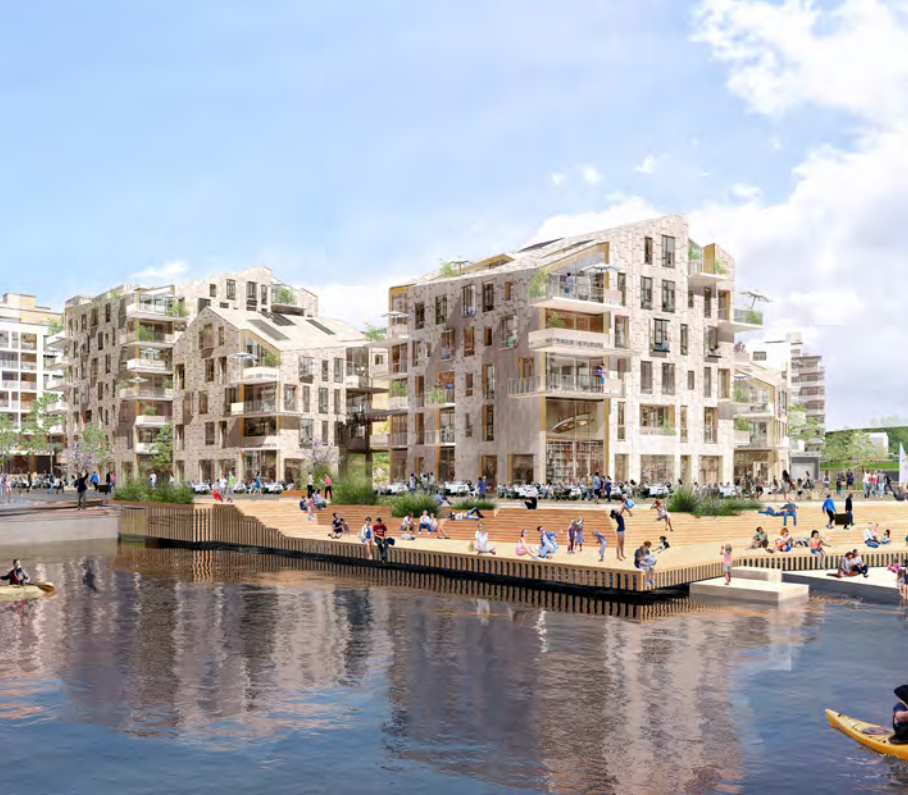
PROJECT BISPEVIKA, OSLO // VANDKUNSTEN ARCHITECTS