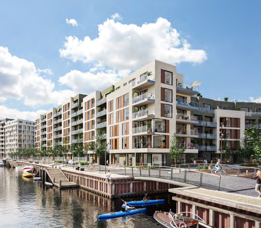
PROJECT MYRHOLM, COPENHAGEN // DANIELSEN ARCHITECTURE