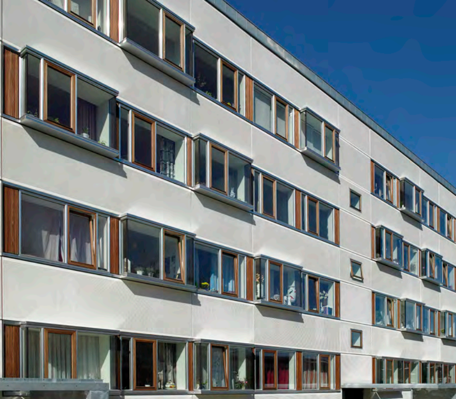
GYLDENRISPARKEN, COPENHAGEN // VANDKUNSTEN, WITRAZ & WISSENBERG ARCHITECTS