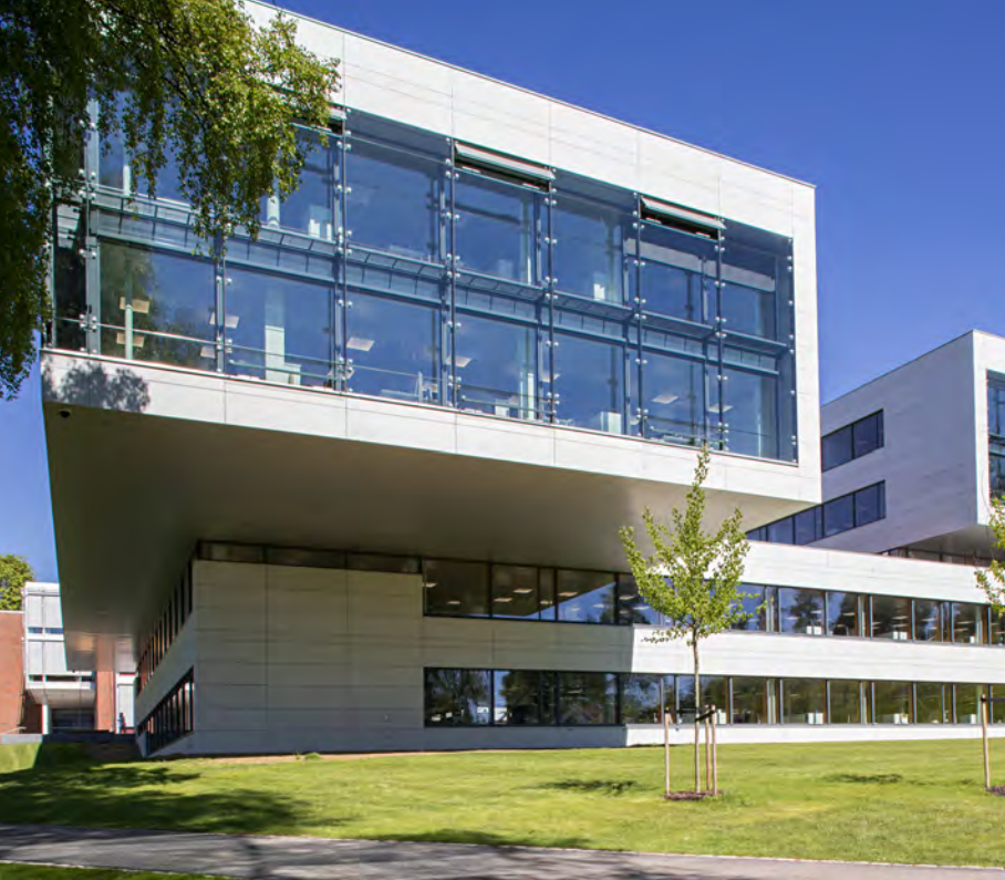
THE NORWEGIAN VERITAS 3, OSLO // LUND+SLAATTO ARCHITECTS