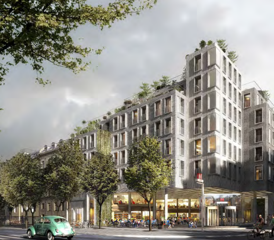
PROJECT FREDERIKSBERG ALLÈ 41, COPENHAGEN // COBE ARCHITECTS