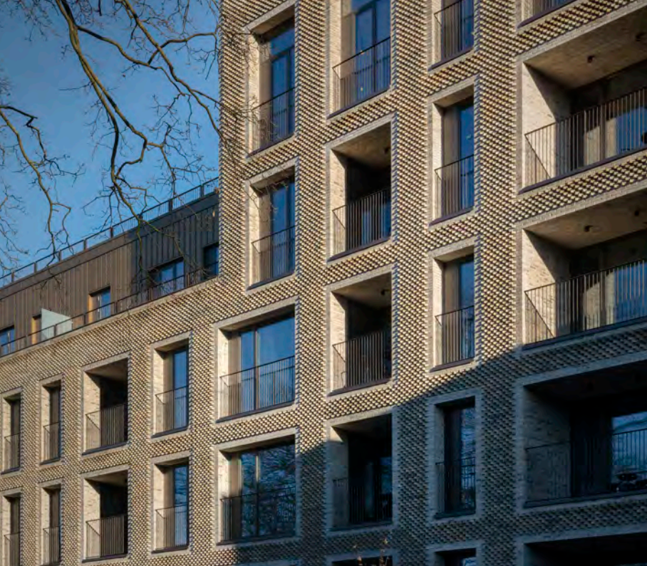
RESEARCHER APARTMENTS, CARLSBERG, COPENHAGEN // PRAKSIS ARCHITECTS