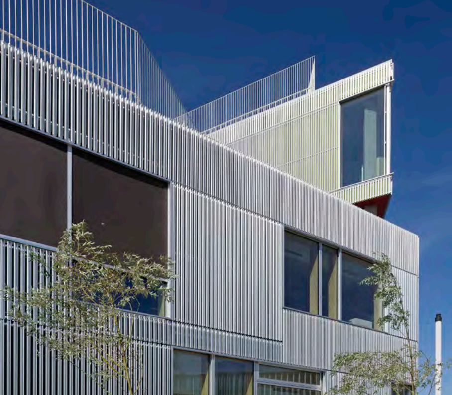
SYDHAVNSSKOLEN, COPENHAGEN // JJW ARCHITECTS