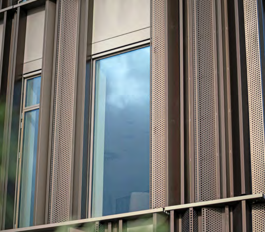
Windows and doors in composite