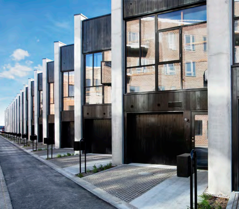
UPCYCLE STUDIOS, COPENHAGEN // LENDAGER GROUP ARCHITECTS