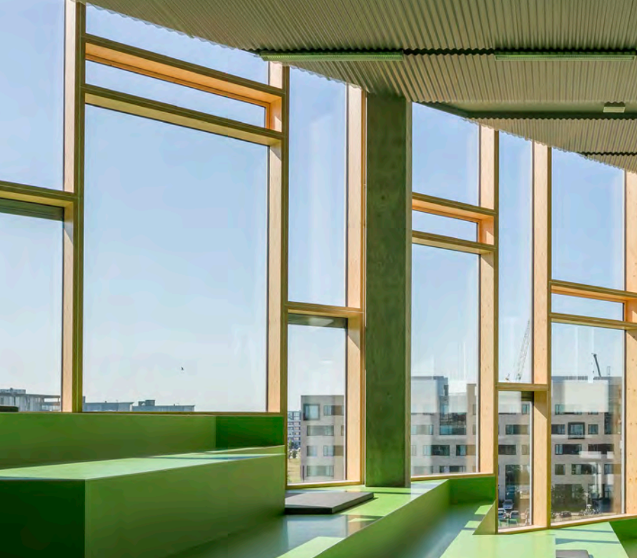
LVL/aluminium windows and extra deep frames with seating