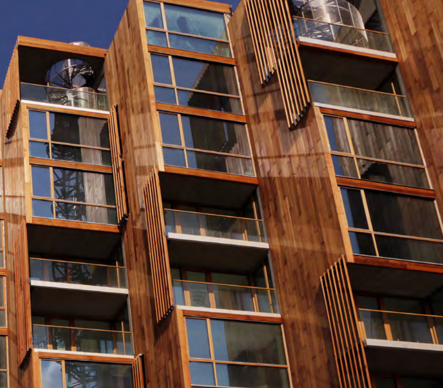
Oak windows and doors, deep frames and oak fire elements